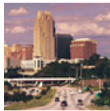
In Pictures: Best Places for Business and Careers

The news on the economy in recent months has been uninspiring. The subprime lending mess threatens to accelerate the housing slowdown. Gas prices are at their highest in eight months. Gross domestic product growth this year is expected to be less than 3% for the first time since 2003. But one part of the country consistently manages to produce strong economic growth and still keep costs down. For the second straight year the Southeast placed 5 metros in the Top 10 of our Best Places for Business and Careers. While most economies in the West have also outperformed their peers in the Northeast and Midwest over the past four years, living costs there have risen dramatically. Housing prices in Phoenix, spurred in part by easy lending, are up 57% in the past two years, knocking it off our Top 10.